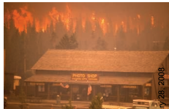
Too close for comfort. Wildfire is seen approaching Old Faithful Village, Yellowstone National Park, in 1988.

Higher spring and summer temperatures and earlier snowmelt are extending the wildfire season and increasing the intensity of wildfires in the western United States.